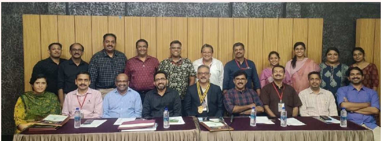
Office Bearers 2024-25