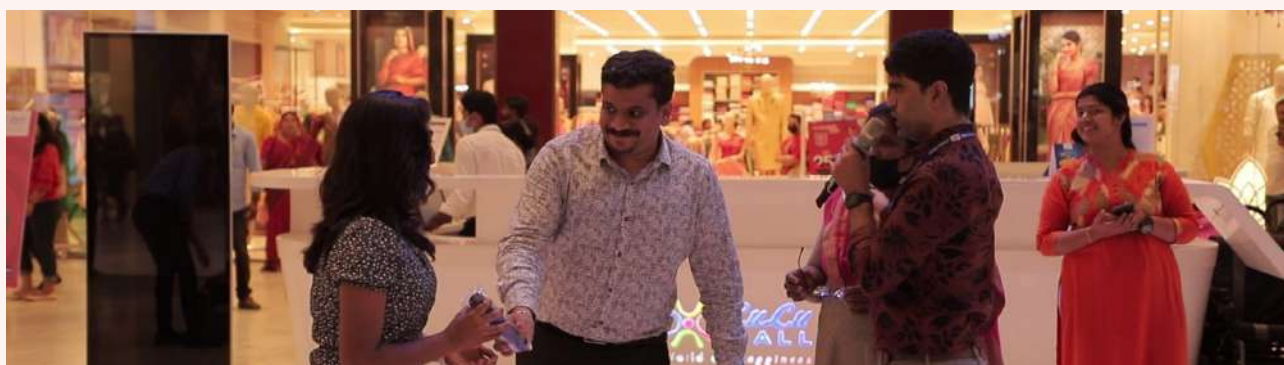
Oral hygiene quiz for the public at Lulu mall Thiruvananthapuram