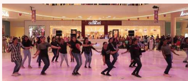
Flash mob conducted at Lulu mall Thiruvananthapuram