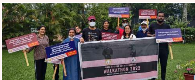
Walkathon in association with the Indian Dental Association Thiruvananthapuram Branch